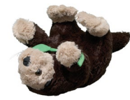
Sea Otter 12"