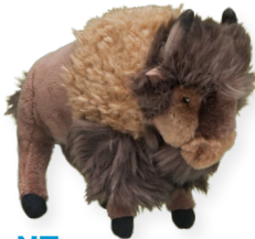
Bison NT SYMBOLIC ADOPTION LEVELS $100 / $60 / $25

The mating season peaks in May and August but the fertilized embryo doesn’t implant in the uterus until fall when the female enters the den. This delayed implantation allows the female bear’s body to physiologically “assess” her condition and not waste fat reserves and energy in sustaining a pregnancy.