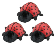
Ladybug 8" (Set of 3)