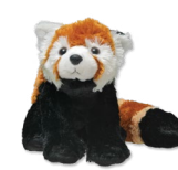
Red Panda 12"