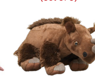
Sumatran Rhino 12"