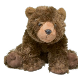
Grizzly Bear 12"