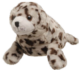
Harbor Seal 12"