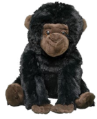
Gorilla Infant 12"