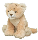
Lion Cub 12"