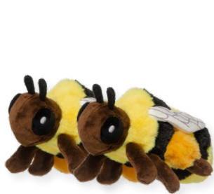
Bee VU SYMBOLIC ADOPTION LEVELS $100 / $60 / $25 TWO FREE WITH A DONATION OF $60 OR MORE!

There are over 20,000 different species of bees in the world and some 4,000 species that live in the US and Canada alone. These pollinators help plants produce some of our most popular foods, like blueberries and squash, and keep ecosystems functioning and healthy.