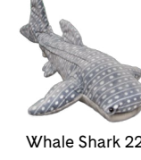
Whale Shark 22"