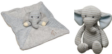
Elephant Baby Set

Featuring two-toned fabrics, these plush represent some of our most popular species. Each measures 14" tall.