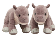
Hippopotamus Calf 8" (Set of 2)