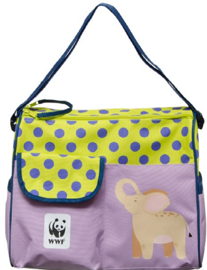
Elephant Diaper Bag

WWF giraffe onesie with a matching hat and receiving blanket. All pieces are 100% soft cotton. Available sizes are preemie (0-7lb), infant (8-13lb), and small (14-18lb).