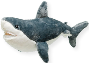
Great White Shark VU SYMBOLIC ADOPTION LEVELS $100 / $60 / $25

Woven from 100% natural fibers to provide ruby-throated hummingbirds with refuge from the elements. It includes a hanger to attach to a tree or hook on your porch. Also included are two colorful plush 8" ruby-throated hummingbirds. Reed grass house measures approximately 9" x 4".