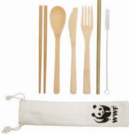
Bamboo Utensil Set DONATION LEVEL $25

Keep the spirit of the outdoors alive by adding a rustic touch to your mug collection. Set of two 12 oz black mugs with a wilderness design and cork bottoms.