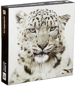
Morten Kolby Snow Leopard Puzzle DONATION LEVEL $60

Reduce your use of plastic with our reusable FSC-certified bamboo chopsticks, spoon, fork and knife, and straw complete with a straw cleaner. Easily transportable in a WWF pouch.