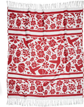
Hummingbird Throw Blanket DONATION LEVEL $60

Warmly welcome guests into your home with a waddle of penguins or colorful flowers and buzzing pollinators. Our welcome mats are made from recycled rubber and Leathaire, a synthetic material that mimics leather. Set includes both designs. Mats measure approximately 15 ¾" x 23 ½".