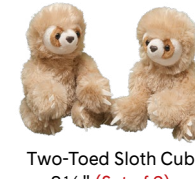
Two-Toed Sloth Cub 8 1/2" (Set of 2)