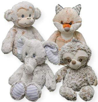
Infant Plush Cuddlers

Featuring the panda logo, this shirt highlights protecting the future of nature worldwide.