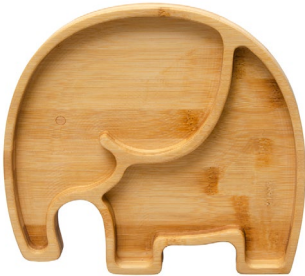
NEW! Elephant Tray DONATION LEVEL $60

Cuddle up with a hummingbird at home and make a difference for wildlife everywhere. Decorated with a red floral pattern, this woven blanket with tassels is made from organic cotton and measures 50" x 60".