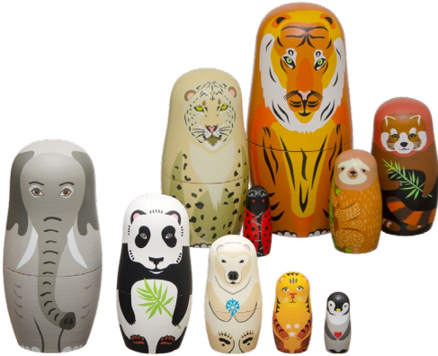
Wildlife Nesting Dolls DONATION LEVEL $75 PER SET

These eco-friendly towels are the perfect substitute for paper towels to reduce waste. The designs include tigers, pandas, sea turtles, elephants, and polar bears plus interesting facts about each species. Towels are 100% cotton jacquard weave and measure 17" x 27 ½".