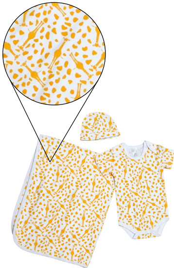
NEW! Giraffe Onesie Set

Send your little one off with a unique backpack sure to generate conversations about conservation. The axolotl is as cute as it is curious-looking. At 16" tall and just the right size for little backs, the backpack is lightweight with child-sized straps. The brightly colored two-toned pink design is sure to delight!