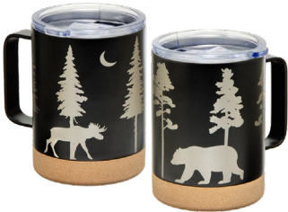
Campfire Style Mug Set DONATION LEVEL $60

Our brightly colored hummingbird beach towel is perfect for summer activities. WWF is on the ground in areas where hummingbirds migrate for the winter, working to safeguard the forests. Made with 100% US grown cotton with a plush velour feel, measuring 30" x 60".