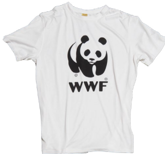
Panda Logo T-Shirt (Unisex)