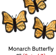
Monarch Butterfly 8" (Set of 3)