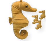
Seahorse 12" (1 Adult, 3 Fry)