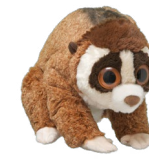
Slow Loris 12"