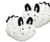
NEW! Sea Bunny 10 1/2" (Set of 2)