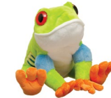
Red-Eyed Tree Frog 12"