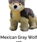
Mexican Gray Wolf 12"