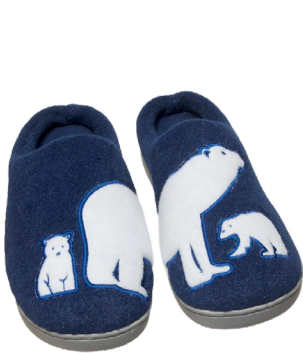
Polar Bear Slippers DONATION LEVEL $60

Walk with polar bears on your feet! These soft slippers provide superior comfort. Flexible soles are durable like leather but washable too. Unisex sizes; details available online.