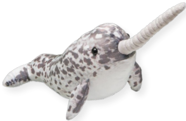
Narwhal LC SYMBOLIC ADOPTION LEVELS $100 / $60 / $25

Arctic foxes are opportunistic feeders and will eat anything they can find, including berries. When food is scarce during the harsh winters, these foxes will trail polar bears to scavenge any uneaten prey.