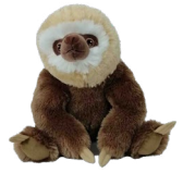
Two-Toed Sloth 12"