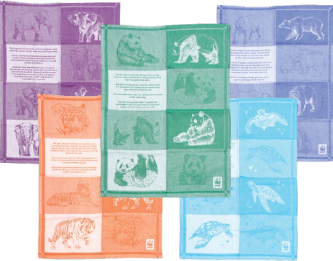
Tea Towel Set DONATION LEVEL $60

These eco-friendly towels are the perfect substitute for paper towels to reduce waste. The designs include tigers, pandas, sea turtles, elephants, and polar bears plus interesting facts about each species. Towels are 100% cotton jacquard weave and measure 17" x 27 ½".