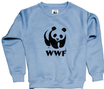
Blue Pullover Sweatshirt

A new spin on the sweatshirt, this zip hoodie is oversized without being overwhelming. It will keep you warm and cozy no matter where you go or what you are doing. The soft material hugs you while the ¼ zip gives you the flexibility to control just how warm you want to be. Blue with the panda logo, 100% polyester.