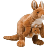
Kangaroo and Joey 12"