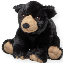
NEW! American Black Bear LC SYMBOLIC ADOPTION LEVELS $100 / $60 / $25

The smallest marine mammal, sea otters live close to shore in temperate coastal waters with rocky or soft ocean bottoms. They eat a variety of seafood and are one of the few mammals that use tools to feed.