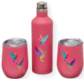
Hummingbird Wine Carafe Set DONATION LEVEL $75

Caught for their jaws, teeth, leather, and fins, which are in demand worldwide and command high prices, great white sharks also face the threat of accidental capture in fishing gear.