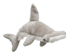
Hammerhead Shark 16"