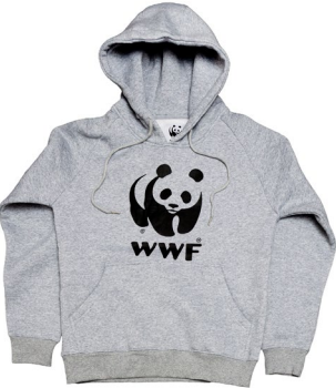
Gray Panda Hoodie

A hoodie so comfortable you'll wear it outside for nature walks or at home to curl up in. Featuring the panda logo, our gray or forest green sweatshirt is a soft 65/35 cotton polyester blend with a terry finish.