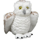
Snowy Owl 12"