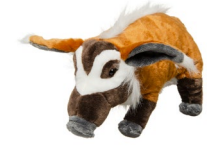
Red River Hog 12"