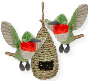
Hummingbird House and Plush Set SYMBOLIC ADOPTION LEVEL $75

There are over 20,000 different species of bees in the world and some 4,000 species that live in the US and Canada alone. These pollinators help plants produce some of our most popular foods, like blueberries and squash, and keep ecosystems functioning and healthy.