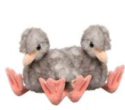
Flamingo Chick 8" (Set of 2)