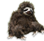
Three-Toed Sloth 10"