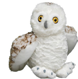
Snowy Owl VU SYMBOLIC ADOPTION LEVELS $100 / $60 / $25

Polar bears live in the Arctic and rely on sea ice to rest, breed, and access the seals that are their primary source of food.