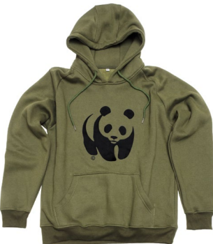
Forest Green Panda Hoodie

Enjoy weekend comfort every day in this 100% preshrunk cotton logo sweatshirt. The blue pullover features the panda logo on the front.