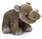
Rhino Calf 12"