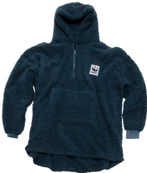
Panda Oversized Blue Snuggle Hoodie

Early morning hikes call for lightweight layers and our ¼ zip polar fleece pullover will provide a layer of warmth. With a zip pocket for cell phone or keys, wear the panda logo proudly and show your commitment to conservation.