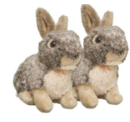
Pygmy Rabbit 8" (Set of 2)