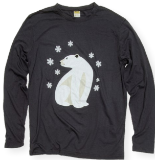
Polar Bear Long-Sleeve (Unisex) DONATION LEVEL $60

A polar bear adorns our snowflake pajamas to create a cheerful mood as you settle in for the night. This two-piece set is made from naturally cozy recycled cotton material.