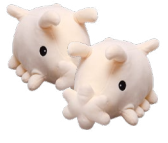
NEW! Sea Pig 10 1/2" (Set of 2)