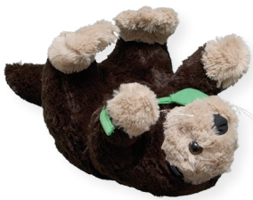
Sea Otter EN SYMBOLIC ADOPTION LEVELS $100 / $60 / $25

Colorful hummingbirds adorn this festive carafe and wineglass set. The stainless steel canteen holds 17 oz, and the stemless glasses hold 12 oz each. All three pieces feature the WWF panda logo, a symbol of hope seen across the globe.