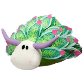
NEW! Leaf Sheep 12"