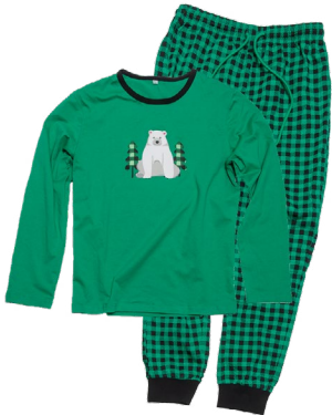
NEW! Polar Bear Green Pajama Set DONATION LEVEL $60

Walk with polar bears on your feet! These soft slippers provide superior comfort. Flexible soles are durable like leather but washable too. Unisex sizes; details available online.