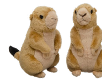
Prairie Dog 8" (Set of 2)