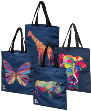
WWF Canvas Tote Set DONATION LEVEL $60

This is one kitchen essential you'll want to show off as a serving plate. Our Asian elephant design will hold all your party treats. Made from FSC-certified bamboo, the tray measures 8¾" x 8½" x ¾". By choosing FSC-certified products, you are supporting responsible management of the world's forests.