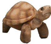
Giant Tortoise 12"