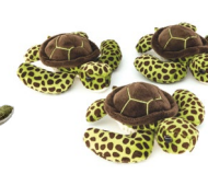
Sea Turtle Hatchling 8" (Set of 3)