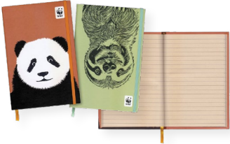
NEW! Wildlife Inspired Journal DONATION LEVEL $25

Never use a plastic bag again! This set of four colorful tote bags—butterfly, giraffe, elephant, and rhino, all animals WWF works to protect. Carry everything you need as you shop or run errands. Made of canvas and measure approximately 16"x13".