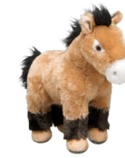
Przewalski's Horse 12"