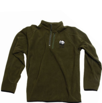
Panda Logo ¼ Zip Green Fleece

World Wildlife Fund is one of the leading conservation organizations in the world. As the challenges facing the Earth grow more complex and urgent, our work has evolved from just saving species and habitats to addressing the global forces that impact them. WWF's efforts are focused on six goals—Climate, Freshwater, Food, Forests, Oceans, and Wildlife—with people at the center. Spread the word about our work by wearing panda gear. Visit wwfcatalog.org to find all the WWF logo items available; sizing available online .