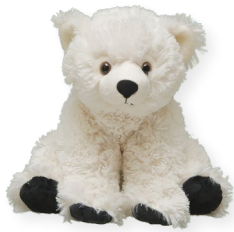
Polar Bear VU SYMBOLIC ADOPTION LEVELS $100 / $60 / $25

The narwhal’s tusk, which can grow as long as 10 feet, is actually an enlarged tooth with up to 10 million nerve endings inside and may have sensory capability.