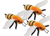
Honeybee 8" (Set of 3)