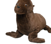
Sea Lion 12"