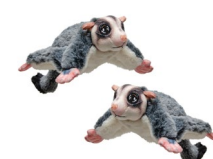
NEW! Sugar Glider 10 1/2" (Set of 2)