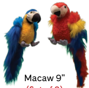
Macaw 9" (Set of 2)