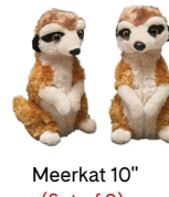
Meerkat 10" (Set of 2)