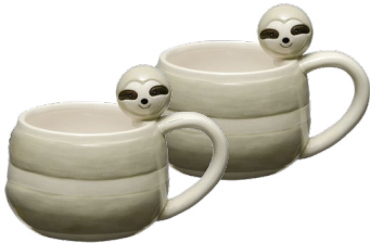
Sloth Mug Set DONATION LEVEL $60

This 1,000-piece puzzle will keep you busy! Piece together the beautiful snow leopard portrait that looks like a work of art. Crafted from FSC-certified cardboard. Puzzle measures 19"x19".