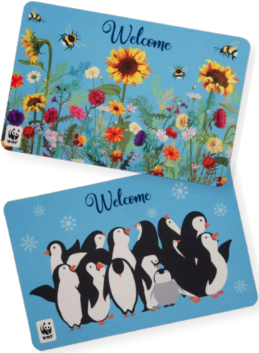
Welcome Mats (Set of 2) DONATION LEVEL $100

Pop off the top (don't twist) and a new animal appears! Open our tiger to reveal a snow leopard and then a red panda and a sloth and lastly a sweet ladybug. You can also open the elephant...to reveal a panda and then a polar bear, a tiger and finally a penguin...all species that WWF is working to protect along with their habitats. Hand-painted wooden animals are perfect for anyone, young and old! Sizes range from 4" to 1½".