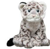
Snow Leopard 12"