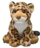
Jaguar (spotted) 12"