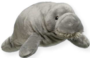
Manatee VU SYMBOLIC ADOPTION LEVELS $100 / $60 / $25

The Tribal Buffalo Lifeways Collaboration was recently announced by the InterTribal Buffalo Council, Native Americans in Philanthropy, The Nature Conservancy, and World Wildlife Fund. This new, historic alliance was created to stabilize, establish, and expand tribal-led bison restoration, and foster cultural, spiritual, ecological, and economic revitalization within native communities. The InterTribal Buffalo Council is a nationwide leader in buffalo restoration supporting 83 tribes in the management of buffalo across 22 states. Bison are cultural keystone species for many Native Nations. Their ecological role is also integral to thousands of natural interspecies relationships across North America. Returning bison to tribal lands is an essential step in restoring these relationships. The Collaboration seeks to support tribal communities with necessary resources such as improved infrastructure (e.g., fencing), training for herd managers, and access to land through co-stewardship, leasing, and acquisition. By uniting our efforts, we are not only fostering ecological and cultural renewal but also ensuring that the leadership and vision of Native communities are at the forefront of this crucial work. Together, we can honor Indigenous traditions but also pave the way for lasting economic and environmental benefits.