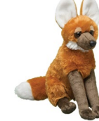
Red-Maned Wolf 12"