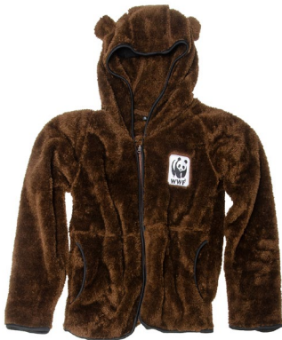
Brown Bear Children's Zip-Up Fleece

Wrap your little one up in our fluffy baby wrap for total comfort and sweet dreams. Made from soft sherpa material with a cotton liner and poly cotton filling. Choose either a blue or cream wrap. Measures 32 ½" x 26 ¼".