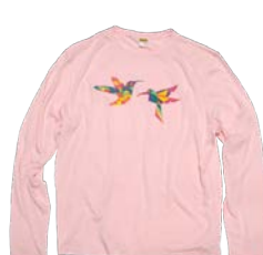
NEW! Long-Sleeve Pink Hummingbird