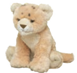
Lion Cub 12"