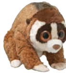
Slow Loris 12"