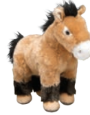
Przewalski's Horse 12"