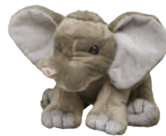
African Elephant Calf 12"