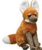
Red-Maned Wolf 12"