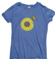
Sunflower and Butterfly