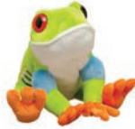
Red-Eyed Tree Frog 12"