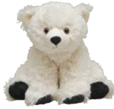
Polar Bear 12"