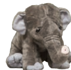
Bornean Elephant 12"