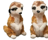
Meerkat 10" (Set of 2)