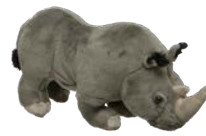
African Rhino 12"