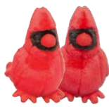
Cardinal 6" (Set of 2)