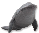
Blue Whale 22"