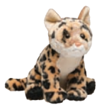
Black-Footed Cat 12"