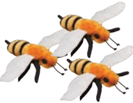
Honeybee 8" (Set of 3)