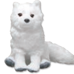
Arctic Fox 12"