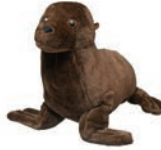
Sea Lion 12"