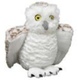
Snowy Owl 12"