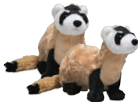
Black-Footed Ferret 10" (Set of 2)