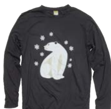
Long-Sleeve Polar Bear