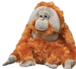
Male Orangutan 12"