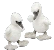
NEW! Blue-Footed Booby Chicks 8" (Set of 2)