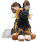
African Wild Dog

Why not combine a selection of wildlife from places as far away as Africa and the Amazon with a species from your own backyard in the Northern Great Plains for a global bucket? The possible combinations are endless...or you can focus on a single species, such as three African elephants or even meerkats! Go online and pick from over 50 fascinating species and Build Your Own Bucket for friends or family... or even one custom-made just for you. Choose any three plush animals for a donation of $75 or add a fourth plush for $100. Each plush is approximately 8". Recommended for ages 3+.