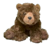
Grizzly Bear 12"