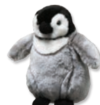
Emperor Penguin (chick) 10"