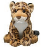
Jaguar (spotted) 12"