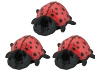
Ladybug 8" (Set of 3)