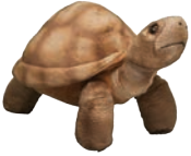
Giant Tortoise 12"