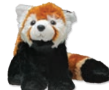
Red Panda 12"