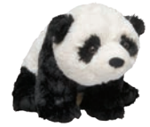
Giant Panda 12"