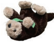
Sea Otter 12"