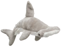
Hammerhead Shark 16"