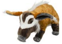
NEW! Red River Hog 12"