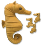
Seahorse 12" (1 Adult, 3 Fry)