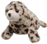
Harbor Seal 12"