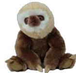
NEW! Two-Toed Sloth 12"