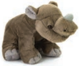
Rhino Calf 12"