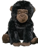
Gorilla Infant 12"