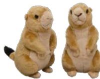
Prairie Dog 8" (Set of 2)