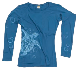
Long-Sleeve Sea Turtle