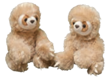
Two-Toed Sloth Cub 8 1/2" (Set of 2)