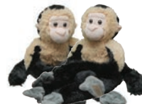
Capuchin Monkey 21" (Set of 2)