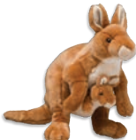
Kangaroo and Joey 12"