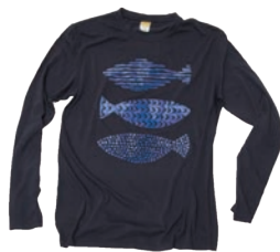
Long-Sleeve 3 Fish