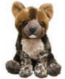
African Wild Dog Pup 12"