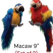
Macaw 9" (Set of 2)