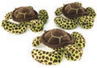
Sea Turtle Hatchling 8" (Set of 3)