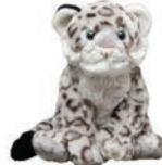
Snow Leopard 12"