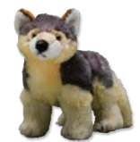
Mexican Gray Wolf 12"