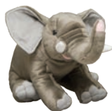
African Elephant 12"