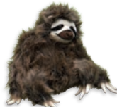
Three-Toed Sloth 10"