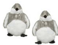
NEW! Black-Footed Penguin Chick 10 1/2" (Set of 2)