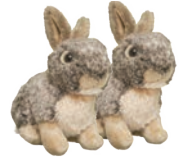
Pygmy Rabbit 8" (Set of 2)