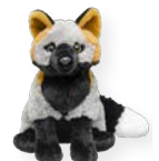
Cross Fox 12"