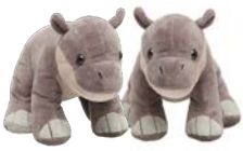
Hippopotamus Calf 8" (Set of 2)