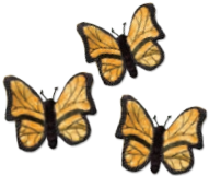
Monarch Butterfly 8" (Set of 3)