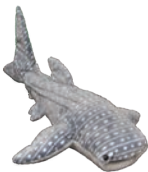
Whale Shark 22"