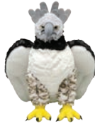
Harpy Eagle 14"